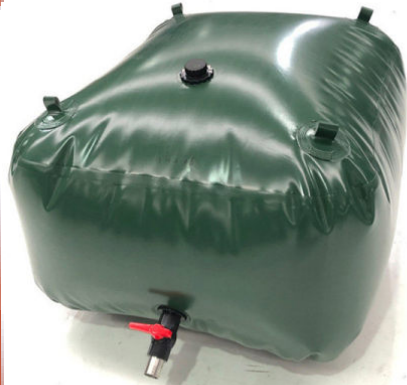
TPU Oil Tank