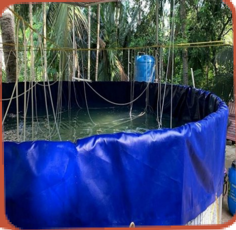
Fishing Tank Liner