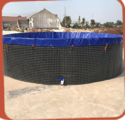
Fishing Tank Liner