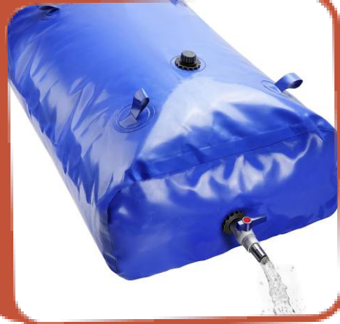
Rectangle Water Tank