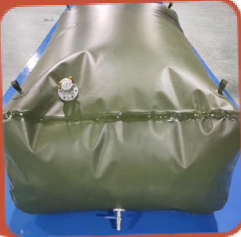
Diesel Oil Tank