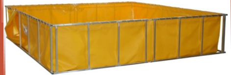
Folding Frame Tank