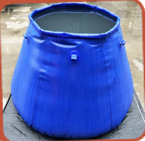
Onion Water Tank