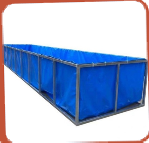
Pop Up Garden Bag