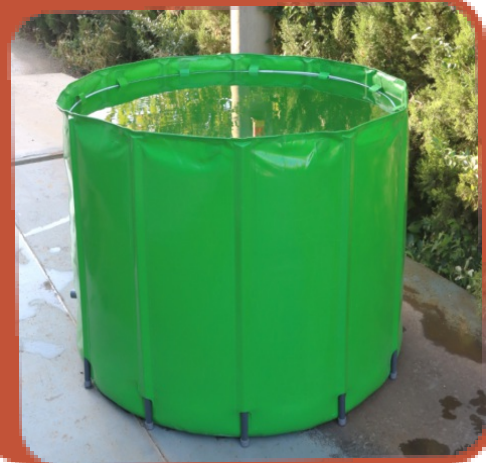
Rainwater Collection Tank