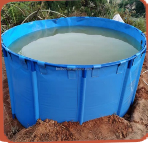
Round Fishing Tank