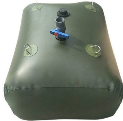
TPU Fuel Tank