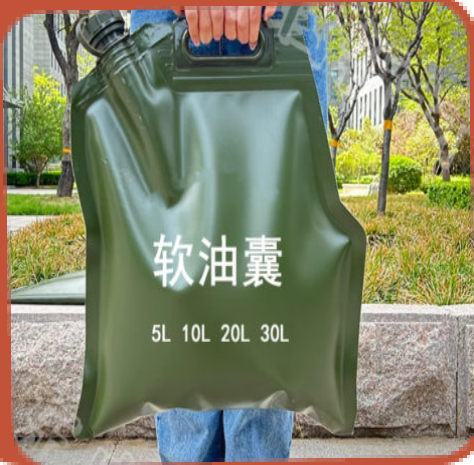
Portable Oil Tank