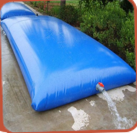
Pillow Water Tank