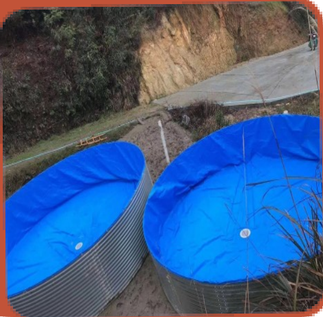
Fishing Tank Liner