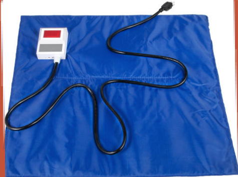
Electric Heating Curing Blanket