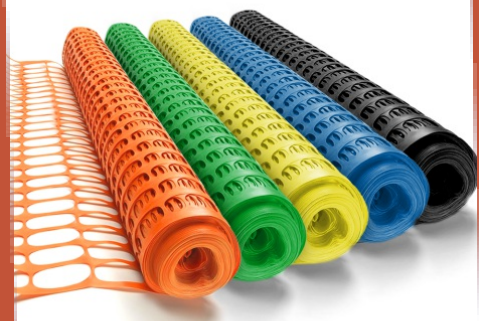
Barrier Safety Fence