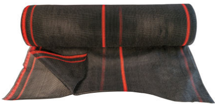
Safety Debris Netting