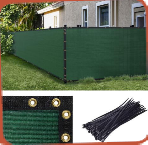
Privacy Fence Screen