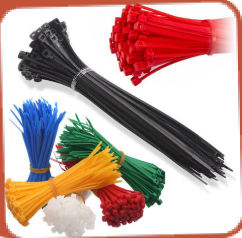
Nylon Zip Ties