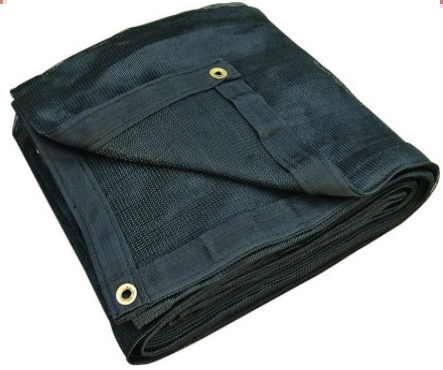
Mesh Debris Tarp