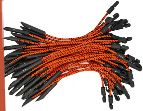
Toggle Bungee Cords