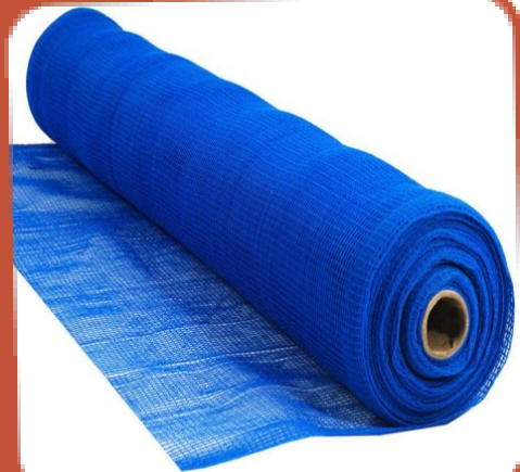
Scaffold Debris Netting