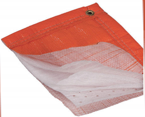
Concrete Curing Blanket