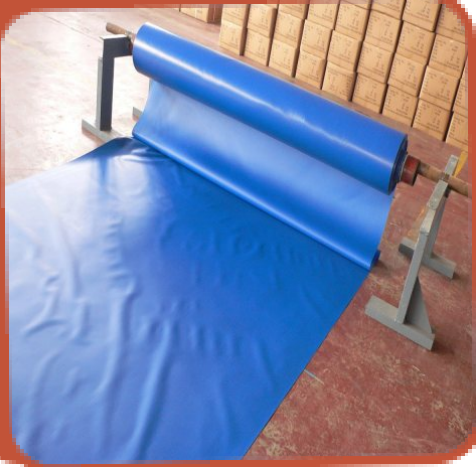
FR Vinyl Floor Covering