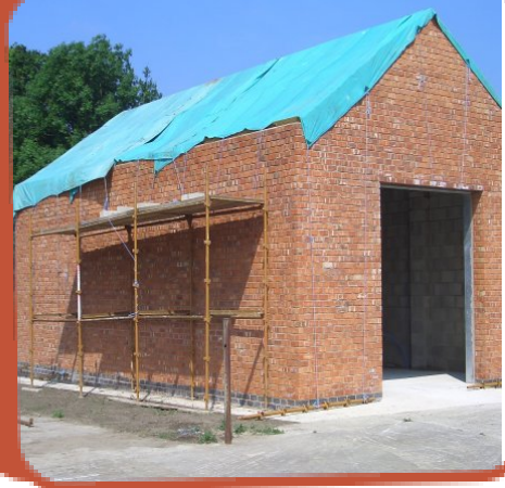
Builder Roof Tarps