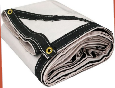
Coated Airbag Tarp