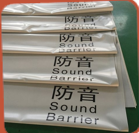
Sound Barrier Tarp